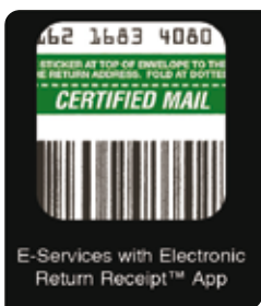
E-Services with Electronic Return Receipt™ App