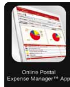
Online Postal Expense Manager™ App

Shortcut keys offer operational efficiency